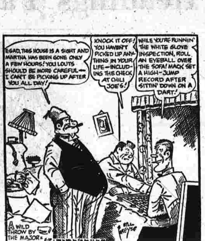
BY ROUSON OUR BOARDING HOUSE